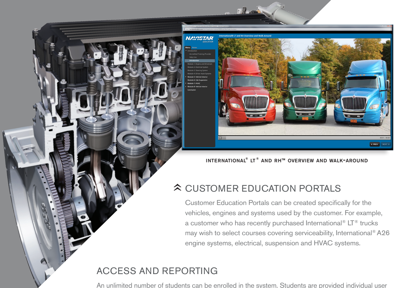
INTERNATIONAL® LT® AND RH™ OVERVIEW AND WALK-AROUND

These education solutions include Customer Education Portals, which provide access to customized web-based courses and instructor-led training at your facility.